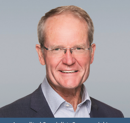
Accredited Specialist: Commercial Law